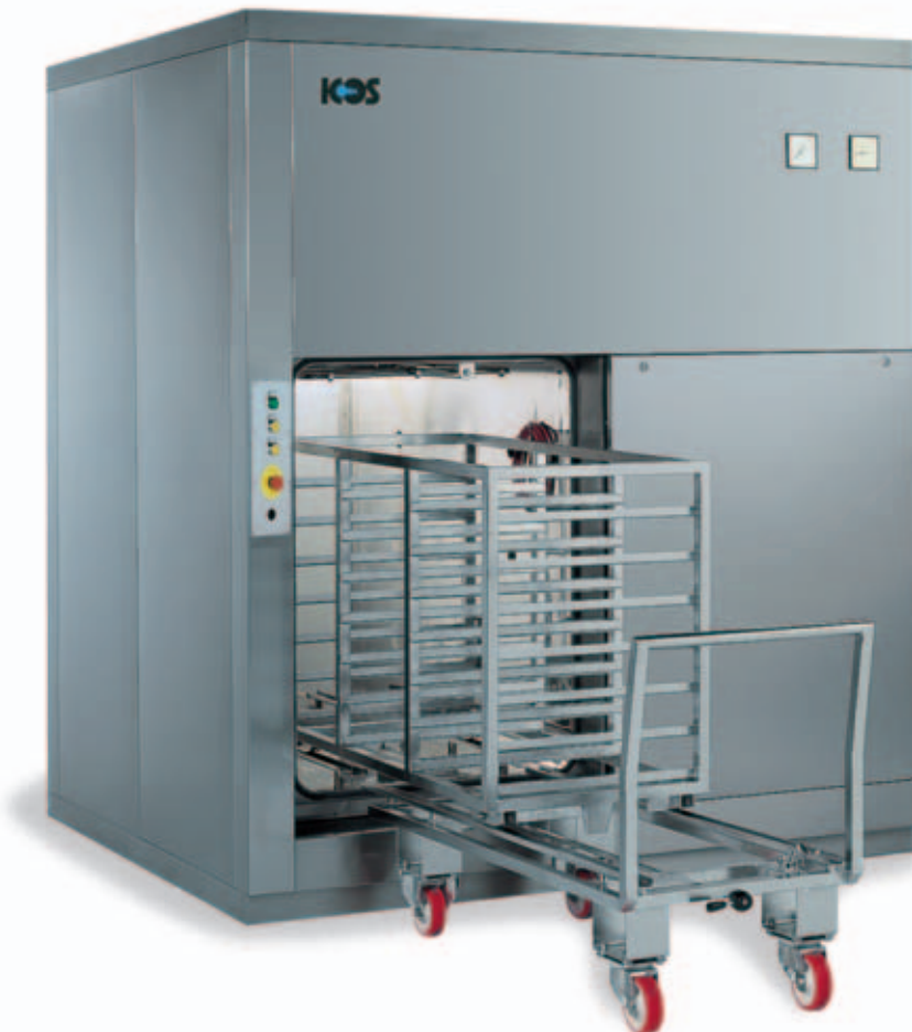
LOADING SIDE - Mod.: AV/S 913